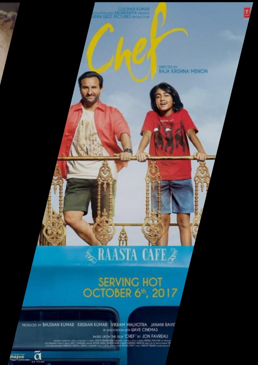
CHEF THEATRICAL MOVIE