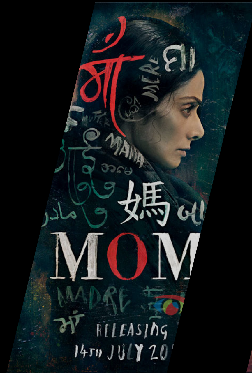
MOM THEATRICAL MOVIE