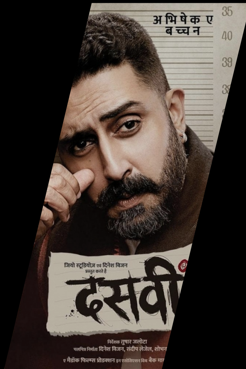
DASVI NETFLIX ORIGINAL FILM